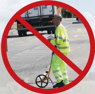
Never again bother with handwheels and clipboards

For 20 years JAMAR has set the standard in vehicle installed Distance Measuring Instruments. Users of JAMAR DMIs have come to appreciate their accuracy and reliability across a wide range of applications.