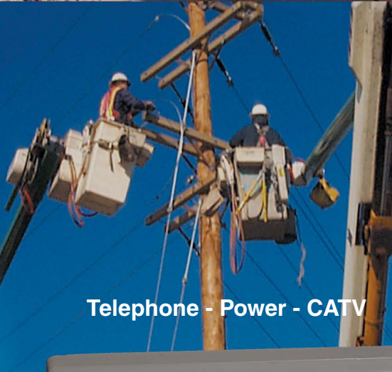
Telephone - Power - CATV