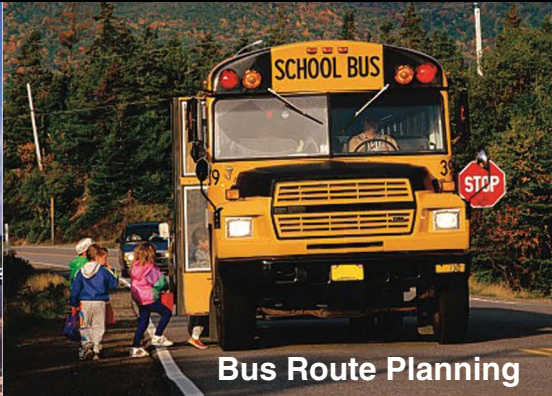
Bus Route Planning