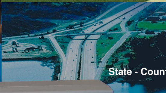
State - County - Local Highway Departments